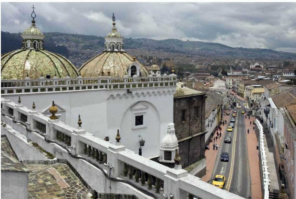
Quito, venue of the 128 th Assembly

Detailed descriptions of the outputs that are needed to achieve the objectives of the Strategy for 2012-2017 can be found in the Annex. A summary of the main issues and challenges under each Strategic Objective, and the resources necessary to achieve them, are described below.