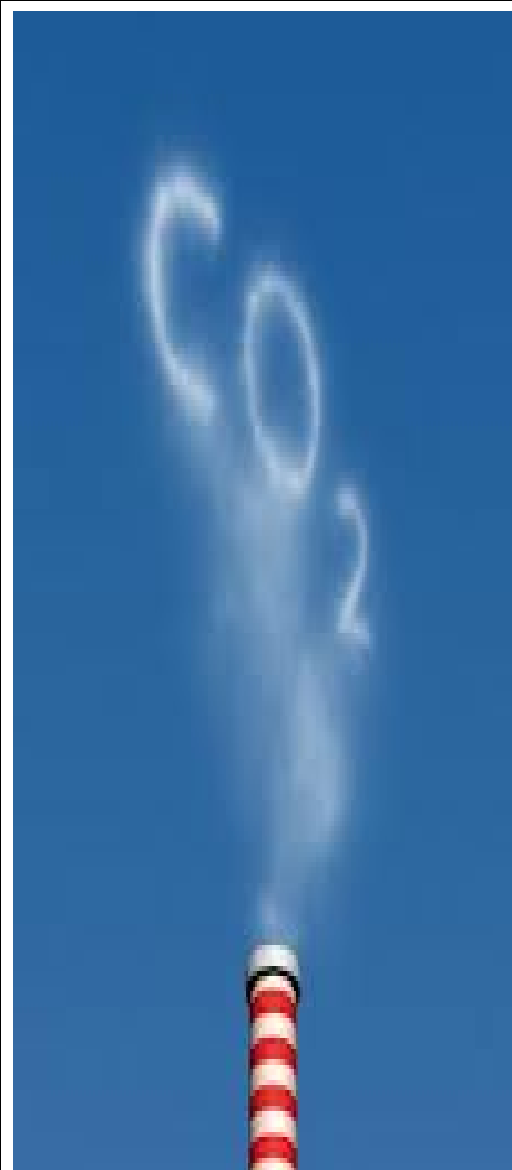
The IPU offsets the carbon emissions from its activities

The IPU is contractually bound to guarantee the payment of the pensions of 11 former employees of the Secretariat. The closed pension fund has a reserve of CHF 9.1 million, which is invested in a mixed portfolio of bonds and equities.