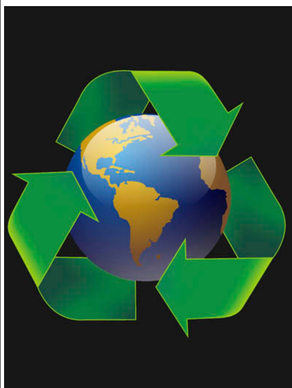
Paper and other consumables are recycled by the IPU

Servicing the Executive Committee's Sub-Committee on Finance will require additional support and documentation from the Division.