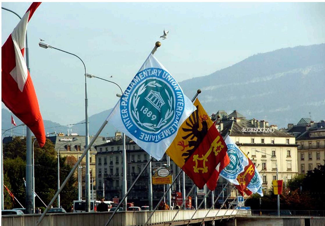
Geneva, venue of the 129 th Assembly