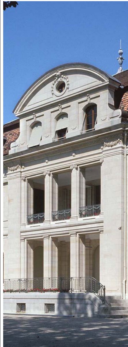
A reserve is established for repairs to the House of Parliaments when they are needed.

By contract, the IPU has to assure the payment of the pensions of eleven former employees of the Secretariat. The closed pension fund has a reserve of about CHF 10 million which is invested in a mixed portfolio of bonds and equities. By 2012, the full amount of the decline in equity values over 2007-09 will have been reflected in the asset value of the fund for actuarial purposes and any future increase in interest rates will reduce the actuarial liability. If equity and bond markets remain stable, then the closed pension fund should be sustainable without further contributions from the IPU.