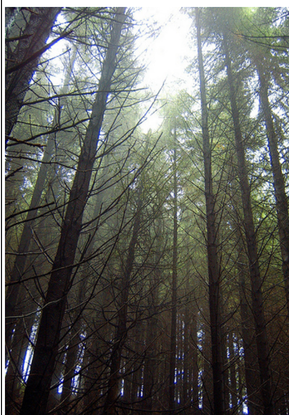
The IPU uses paper from sustainable sources

The establishment of a Finance subcommittee of the Executive Committee will require additional support and documentation from the division.