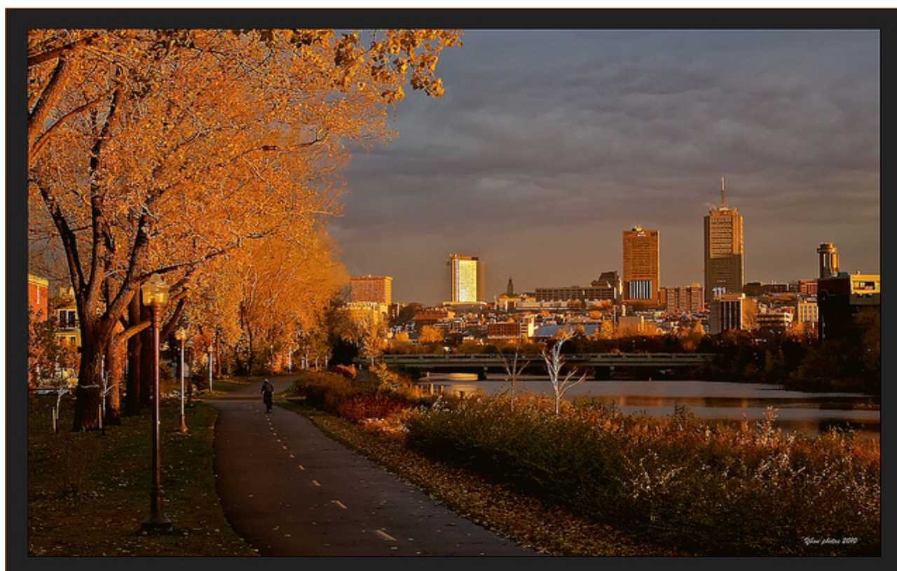
Autumn colours in Quebec City, venue of the 127 th Assembly

Activities will impact on the natural environment. To reduce the deleterious effects, efforts will be made to publish information in electronic format and make use of virtual contacts in order to reduce the need for travel.